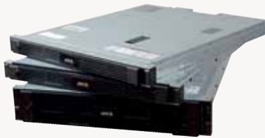
AXIS Camera Station S11 Recorder Series Out-of-the-box ready recording solutions

With Axis network video recorders you get an easy-to-install and reliable solution. They are perfectly adapted to the wide range of Axis products, and are preloaded with all necessary software as well as AXIS Camera Station licenses – with no recurring fees! How many channels does your customer need? Does your customer need a PoE switch? Pick the recorder with enough channels to accommodate your customer's cameras and other devices. The last two numbers of each recorder model indicates how many channels are included.